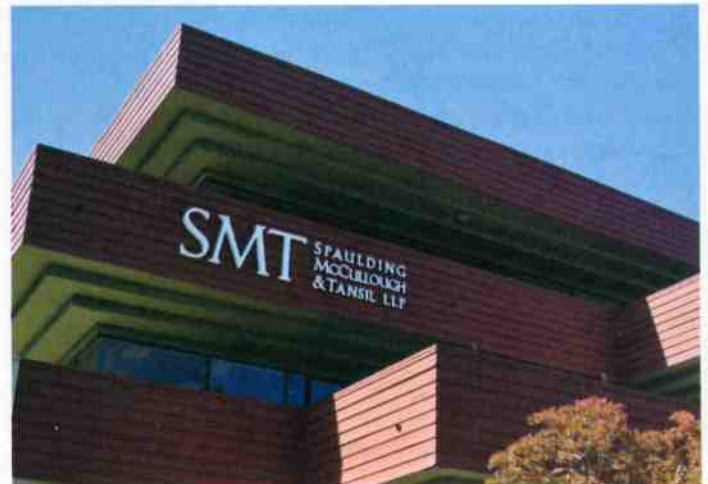
The firm's Santa Rosa location.